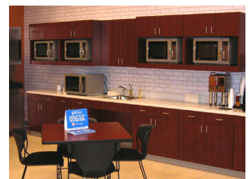
Low flow plumbing fixtures reduce water use