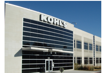
LEED Core+Shell Silver certified building

RP Kohl's earned Regional Priority credits for exceptional performance in energy use reduction for lighting and recycling a high percentage of construction waste. 2/4