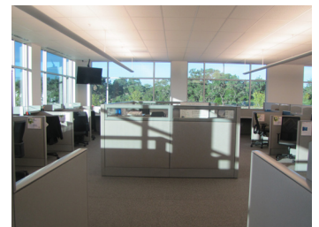
Low VOC materials improve indoor air quality